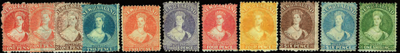
- 1809 -